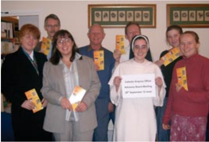
Some of the Board members with the latest CEO leaflet

In the coming year, five main projects are being worked on including further website development and the creation of a more pro-active "Follow-up" strategy. Please keep this work in your prayers.