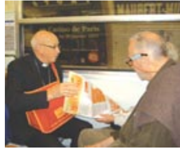
Bishop Ambrose evangelising on the Paris Metro

Never mind "Paris in the Springtime", the French capital was the place to be this autumn. That's certainly what the 3,000 plus delegates at ICNE, the International Congress on New Evangelisation , found.