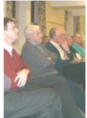
Clergy taking part in one of the day's sessions.

Subject to request, it is hoped similar events can be run in other dioceses during 2005.