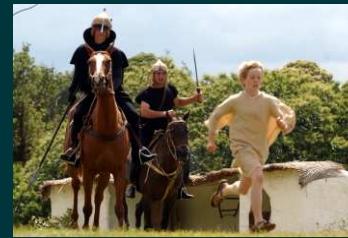
The Massacre of the Innocents

Those attending will need to bring packed lunches, although very limited light refreshments are available for purchase. The event is in the open air so all will need to be well prepared for rain or shine! If you would like to attend The Life of Christ