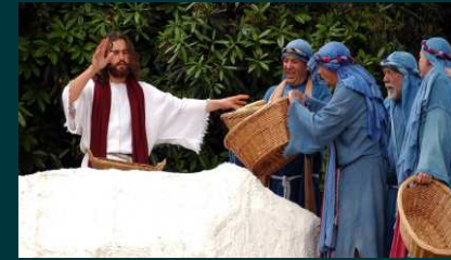
Feeding the Five Thousand