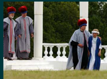
The Boy Jesus in the Temple

2008 please apply for your tickets now by completing the attached booking form. We are expecting 3,000 people each day so coaches need to be booked well in advance.