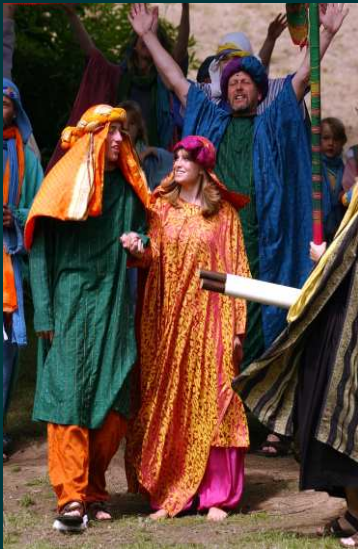
The Marriage at Cana

Please book early and take advantage of our early booking discount, reserve your coach if you are able to bring a party. We regret that in future refunds will not be possible. Please give us the names and addresses of others whom you think may be interested and please contact us if you would like posters or leaflets to help advertise the event.