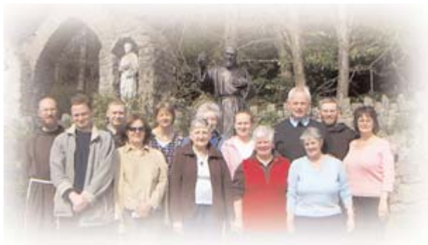
The local team during a CASE led training day

Hopes run high that lessons learnt during this pilot year will enable the project to be run in centres in other parts of England and Wales. If you are interested in finding out more please see: www.life4seekers.co.uk