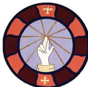
Detail of a specially commissioned Trinity icon which accompanied the prayer tour preceding the day.

...even on a freezing cold Saturday in December! The fiery zeal of faithful Catholics across the town-wide deanery of Blackpool in the Lancaster Diocese was obvious not just in the numbers that attended the Deanery Evangelisation Day in December, but also in the careful way they had prepared. In the two months leading up to the day, Holy Hours of Prayer for Evangelisation were held in parishes across the deanery.