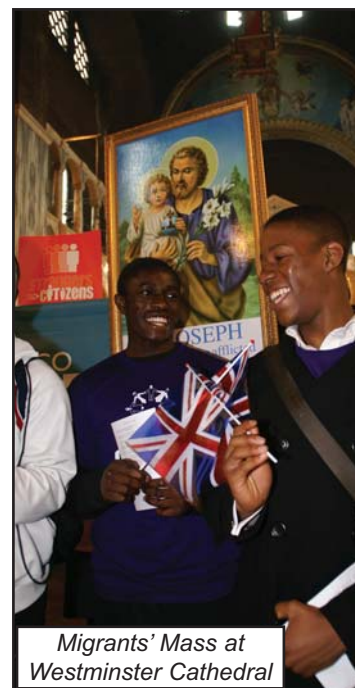
Migrants' Mass at Westminster Cathedral

As Catholics, how aware are we of having a particular culture or identity, or a particular way of doing things? Is our Catholic culture markedly different from the world around us?