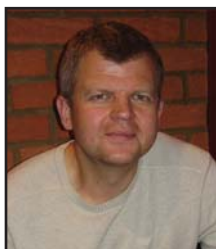
Adrian Chiles, BBC Presenter

What do a national BBC TV presenter, an international rugby league coach, an ex-EastEnd gangster and a Catholic Archbishop, have in common? They all feature in our brand new magazine for non-Catholic enquirers. It's packed with fascinating articles about prayer, sexuality, social justice, the Sacraments... it even has a problem page!