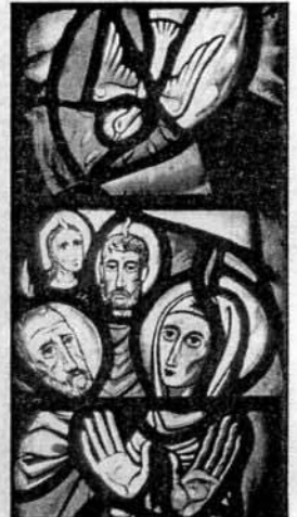
Witness: What better prayer could there be this Pentecost than to ask God to surprise us by leading us in the power of his Spirit to share our faith with just one extra person?

Now is not the time to hold back and CASE is here to help.