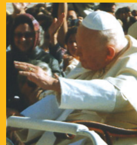
Pope John Paul II

The Catholic Church takes care of its community through a network of leaders, teachers and helpers. The head of the Catholic Church worldwide is Pope John Paul II. Locally, the Church is led by bishops and priests.